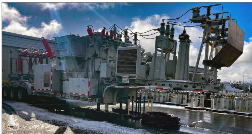
Figure 3. Example of a Mobile Substation

Given the challenges above, managing a limited inventory that may not meet demand for every utility would require decisions about who receives a transformer in an incident where multiple utilities suffer losses. However, smaller utilities we spoke with suggested that a strategic federal reserve of mobile substations—which include transformers—could provide a temporary stopgap while utilities acquired permanent replacements (see fig. 3 below for an example). Some of these officials told us that establishing a federal inventory of mobile substations would still face some of the challenges described above, depending on its configuration. Furthermore, utility officials described other ways the federal government could ensure adequate transformer reserves. For example, some officials suggested that federal entities, such as the power marketing administrations, could securely store privately owned spares on their property. Others suggested that the federal government could survey utilities to develop and share a comprehensive list of available spares nationwide.