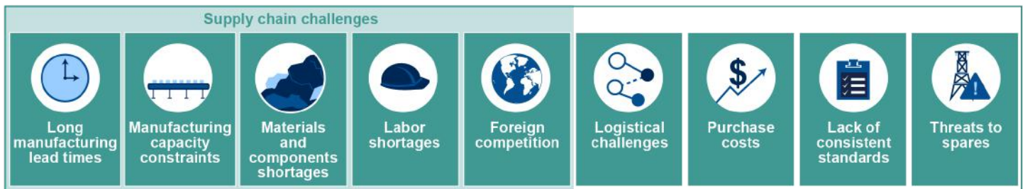
Figure 2. Challenges for Electric Utilities Attempting to Ensure Adequate Reserves of Transformers